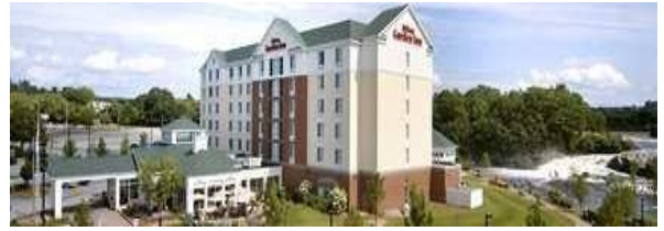
The Hilton Garden Inn Auburn Riverwatch 14 Great Falls Plaza / Auburn, Maine 207-784-4433

You spoke and we listened! We're going some place new for the 86th Annual MFDA Convention. This year, the Hilton Garden Inn Auburn Riverwatch, Auburn, Maine will serve as convention headquarters.